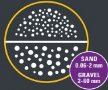
SAND 0.06-2 mm GRAVEL 2-60 mm