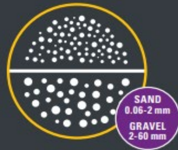
SAND 0.06-2 mm GRAVEL 2-60 mm